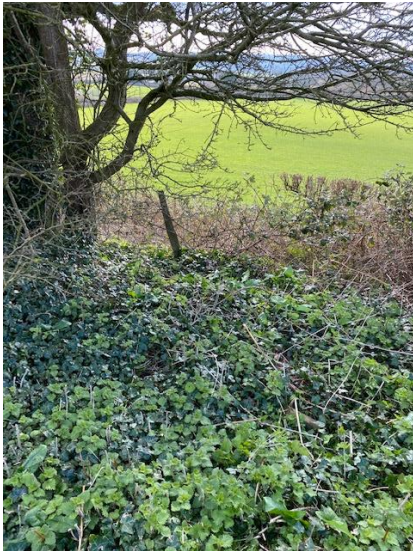
WN 19/2 Smallway Lane. Fingerpost down.